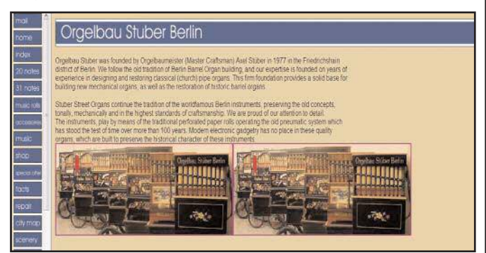
Figure 5. Orgelau Steuber (www.berliner-drehorgel.de)

Note: many of Ian's rolls are available through Orgelbau Steuber (see below).