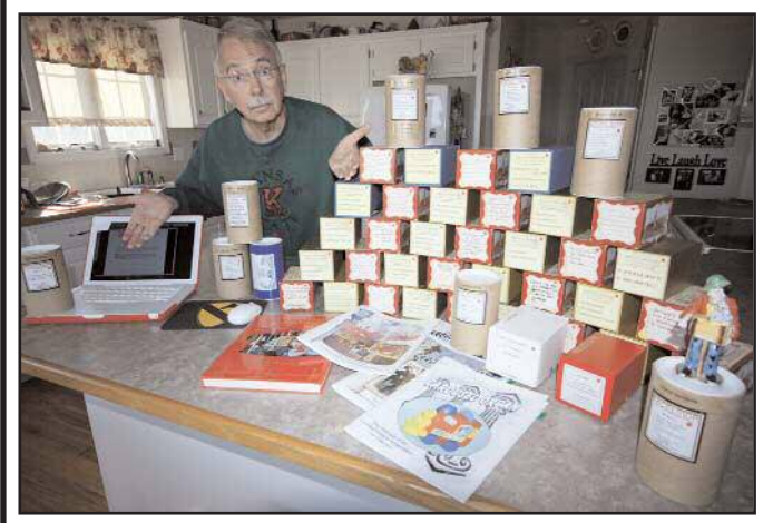
Figure 1. The author with numerous rolls from many makers.

was looking at my suitcases of 20-note music rolls and asked myself, "How did I ever acquire all these boxes?" The answer is complex, but essentially my collection has grown through many years of trades, purchases and anecdotal fact sharing with other grinders—thus the idea for this article. My intent is to (1) share some of the tips I have learned over the past 15 years, and (2) provide a roundup of current arrangers and vendors. All though focused on the 20-note scale, grinders of other scales and media should find this roundup useful ( Figure 1 ).