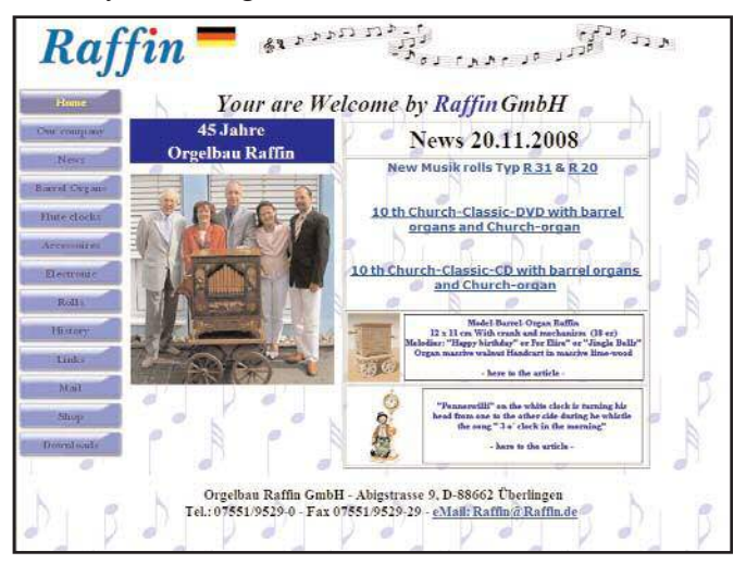
Figure 2. Orgelbau Raffin's web site (www.raffin.de).

Methodology—I developed a list of arrangers and vendors based upon my experience and input from several trusted grinders. All were contacted via email to determine their current status in the marketplace. The response was very good with only one negative contact. If I missed someone, please let me or the editor know for a footnote in future editions. Finally, language is not an issue in communicating with anyone as English works across the board.