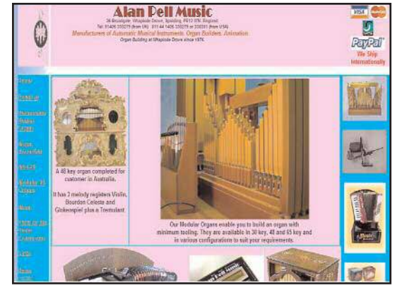
Figure 7. Alan Pells web site (www.alanpell.com).

available tunes. I have never seen or heard a 20-note r o 1 1 punched by Alan, but he tells me he is ready to